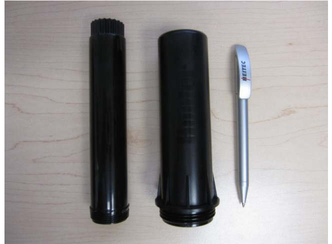
Irrigation Sprinkler Body