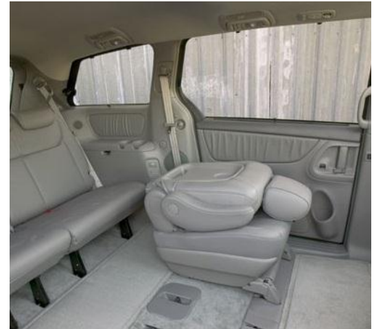
Toyota Sienna Interior Vent